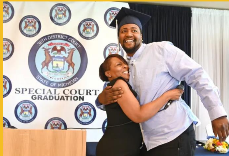
Hon. Shannon Holmes & participants during 36 th District Court, Wayne County Treatment Court graduation.

Completion of a treatment court program culminates in a graduation.